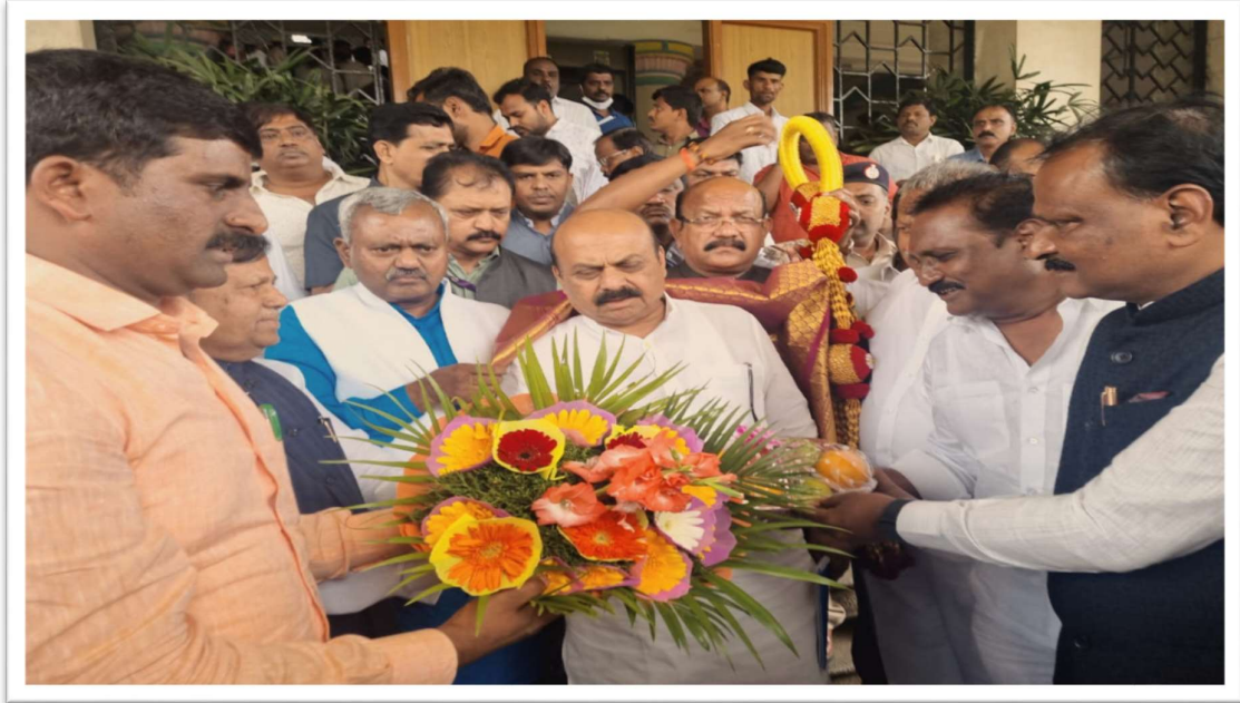
The moment when Sri S.T. Somashekhar, Minister in-charge of Mysore, congratulated