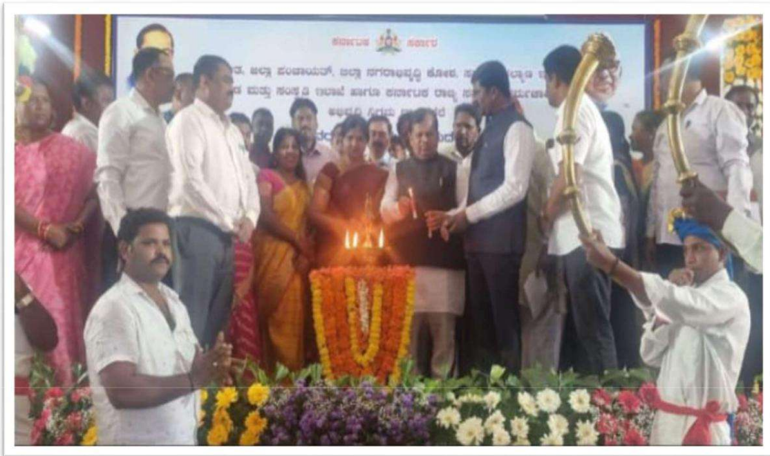
Talent award program held in Davangere district