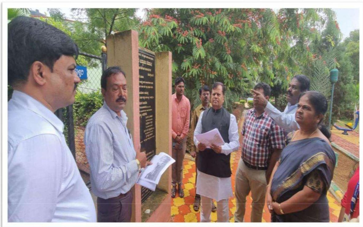
The moment of inspection the rest house of Pourakarmikas built in Gadag.