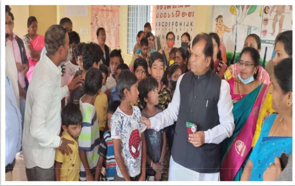
visit to the Government Primary School in the Safai Karmacharis Colony at Kudremoola, Mysore was conducted and the education of the Safai Karmacharis children there was personally inspected.