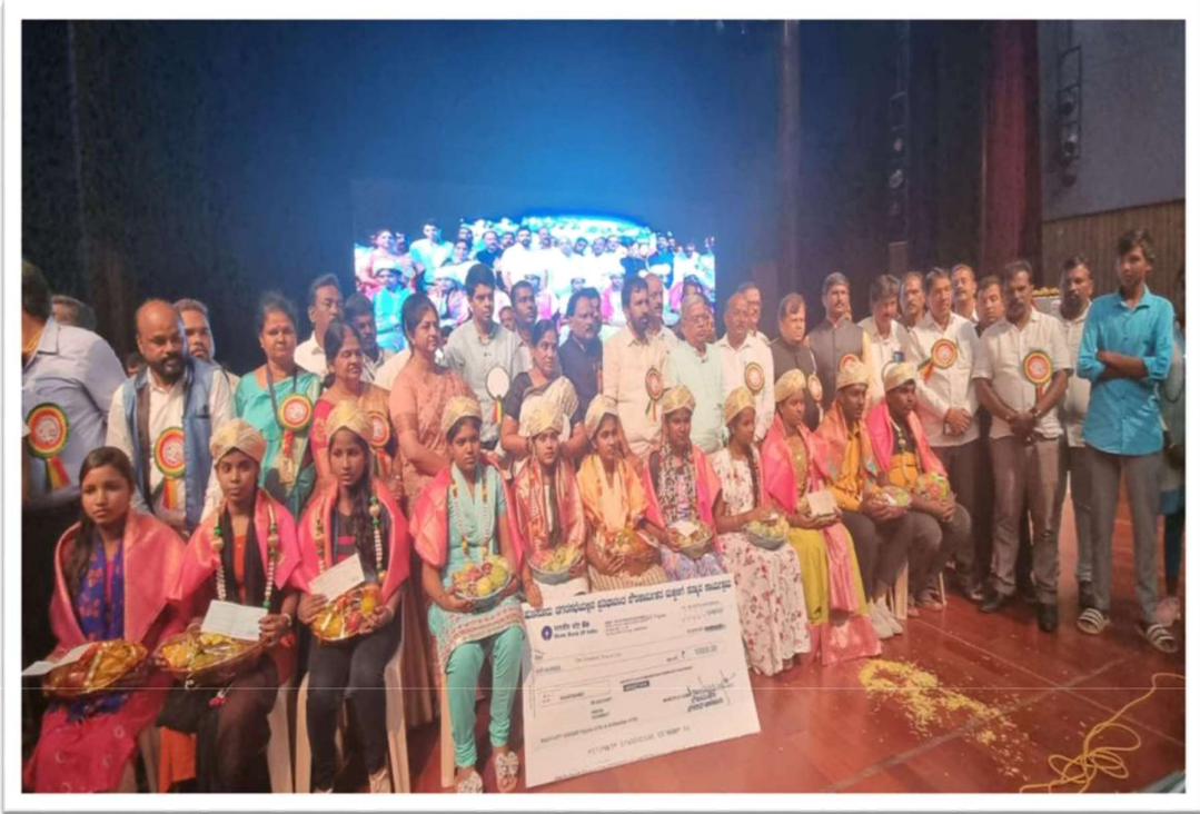
Talent award program held in Mysore district