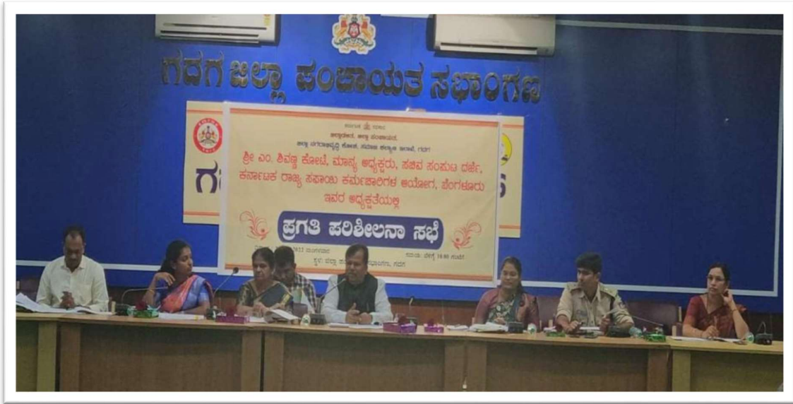
Progress review meeting was held at the Gadag district collectorate hall