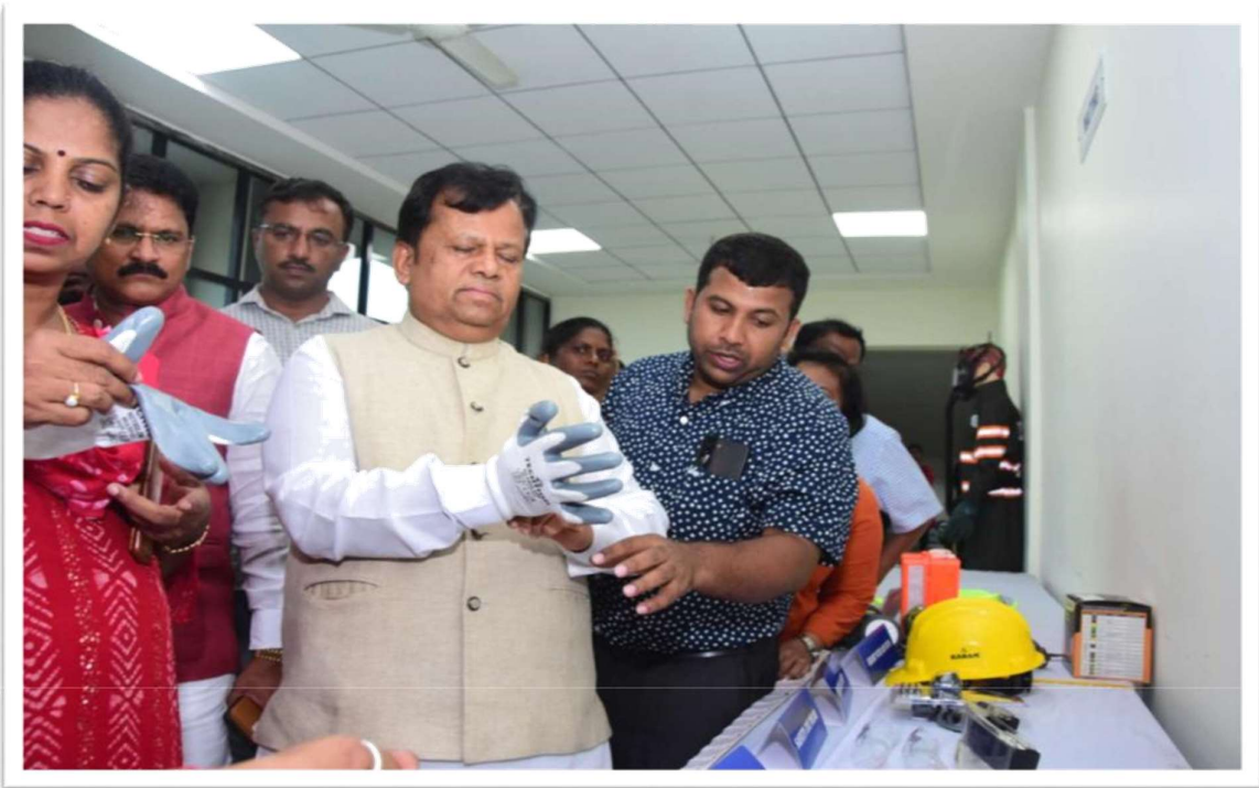
Safety equipment on display at Odisha Water Academy