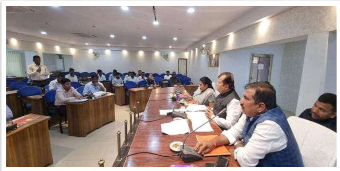
Meeting with district administration and concerned officials regarding the problems of Safai Karmacharis in Bidar district.