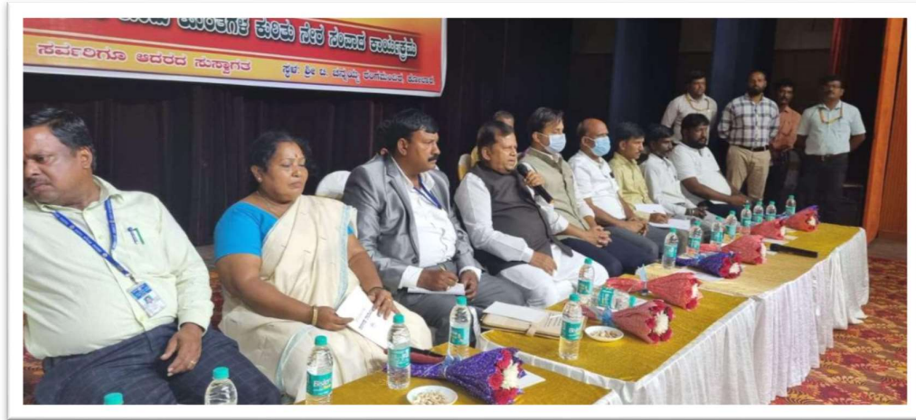
A live interaction program on the grievances of Pourakarmikas held at the District Collector's office, Kolar.