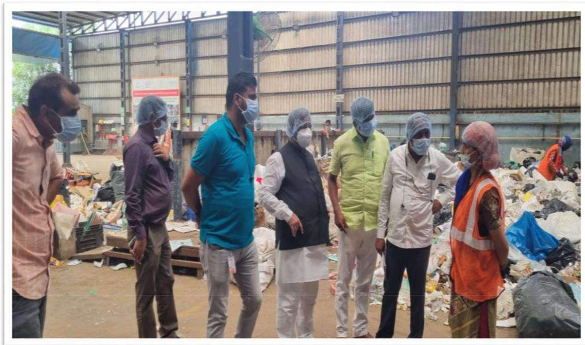
Consultation on tools and safety provided to sanitation workers working in dumping yard in Gujarat state.