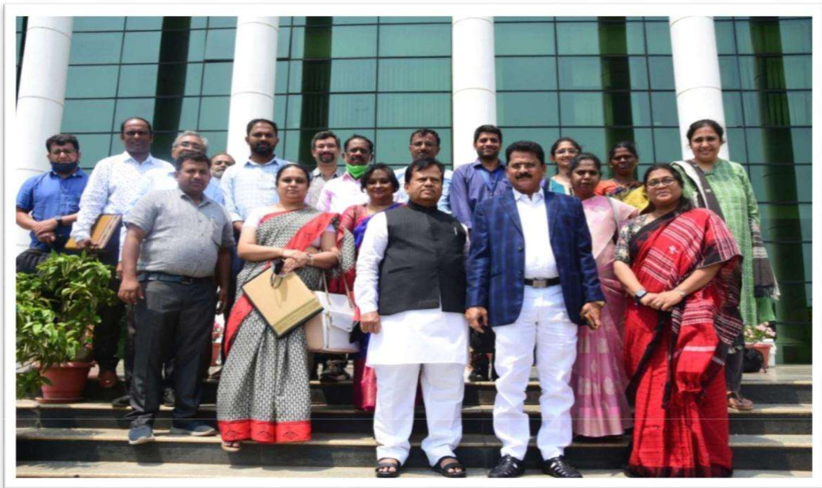
Members of the committee visited Jal Bhavan, Ministry of Odisha State, Bhubaneswar on Date: 07.04.2022