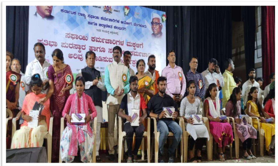
The talent award program of the children of Safai Karmacharis held in Kalaburgi district.