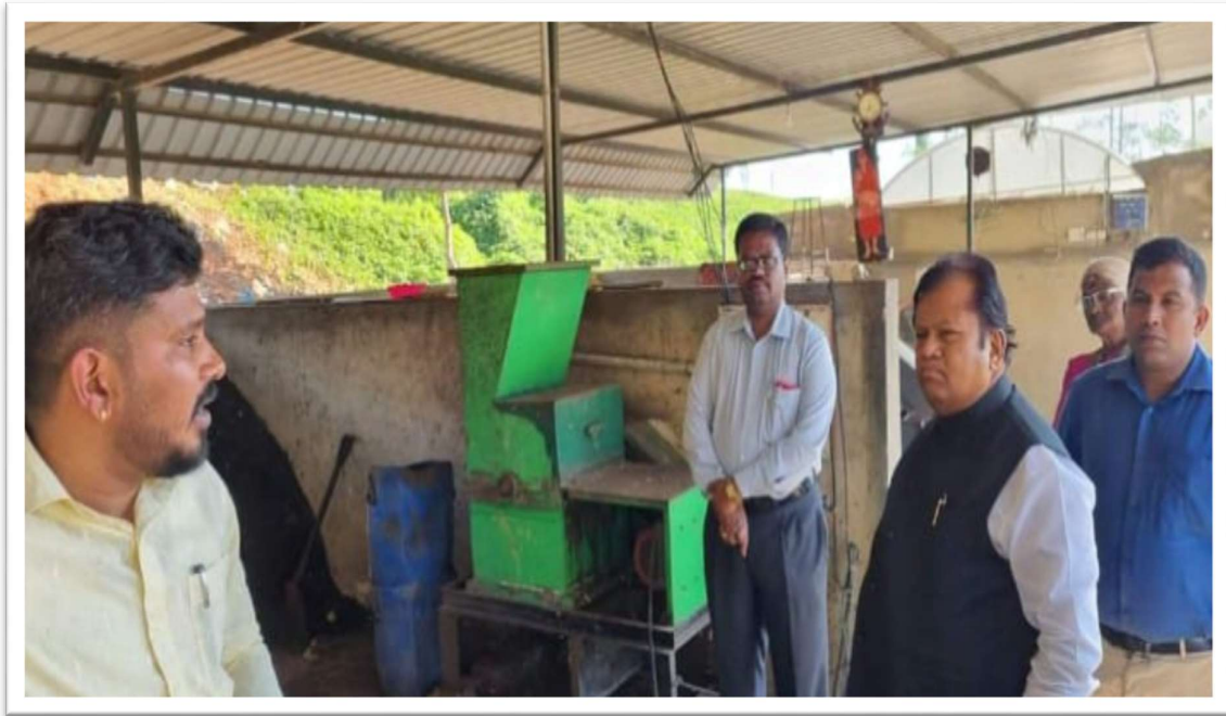
Inspection of sewage treatment plant constructed for the first time in Karnataka at Devanahalli.