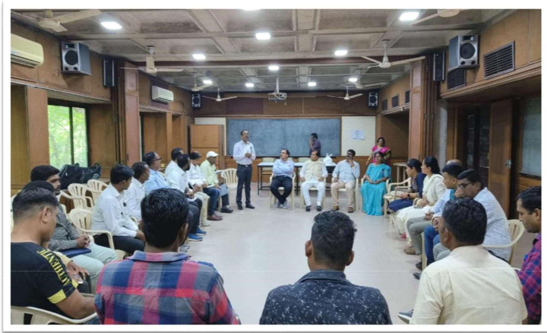
Meeting with Safai Karmachari leaders of Gujarat state.

Among the raw materials separated in this way, bench stones, cement materials like compound wall are sold and used for utilisation in the construction of metro and roads which is a good move, and this practice can be adopted in our State which enhances the development in theState.