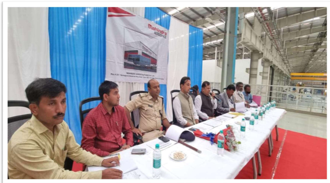
A meeting was held regarding the grievances of saphai karmacharis in Narasapura Industrial Area, Kolar District.