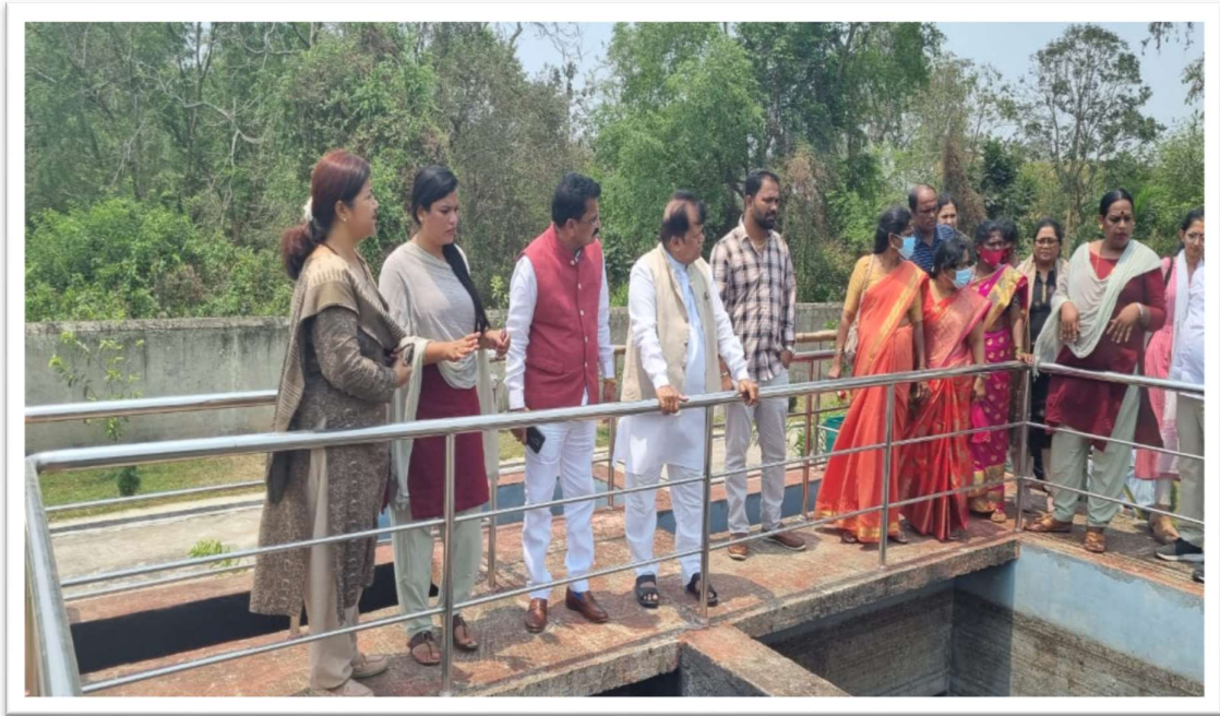
STP plant operated by Transgender Association (Mangalamukhi Sangh) in Cuttack city