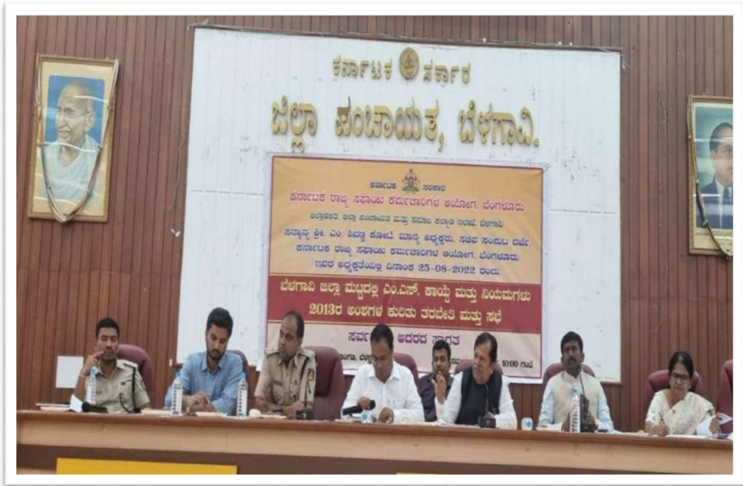
Meeting and training held at district level in Belgaum on aspects of M.S. Act and Rules 2013.