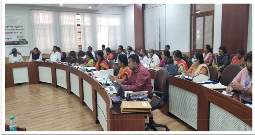
5th meeting of the State Monitoring Committee constituted under Section 26 of the Prohibition of Recruitment of Manual Scavengers and their Rehabilitation Act, 2013 held at Vikasa Soudha