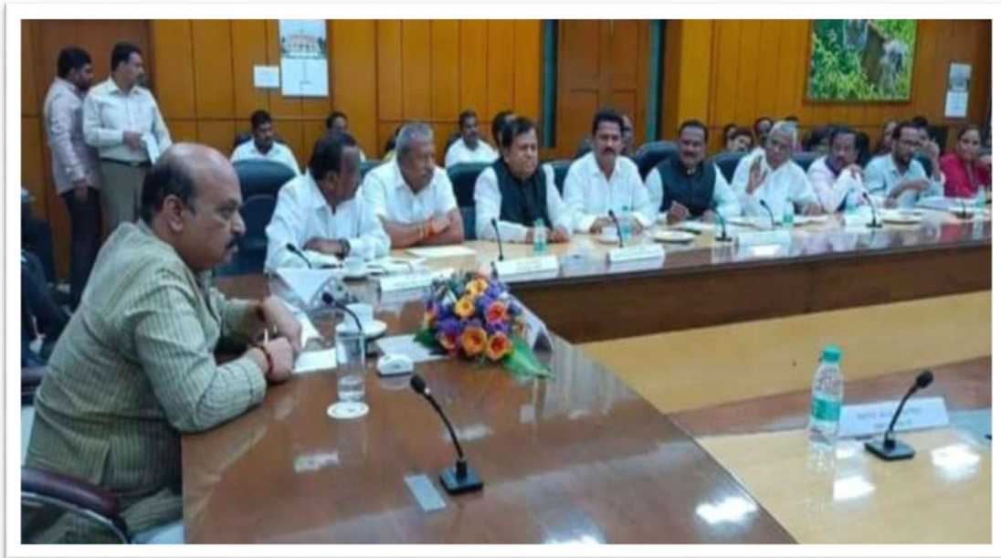
A meeting presided over by Hon'ble Chief Minister for regularisation of all Pourakarmikas working in urban local bodies of the State.