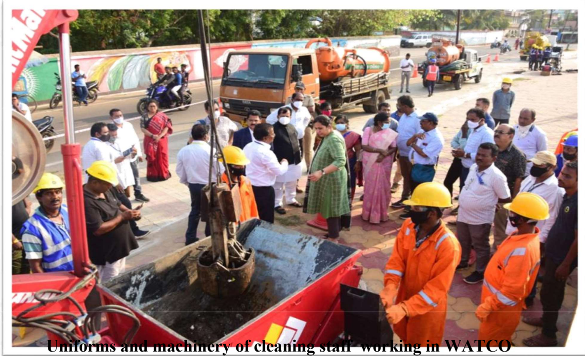
Uniforms and machinery of cleaning staff working in WATCO