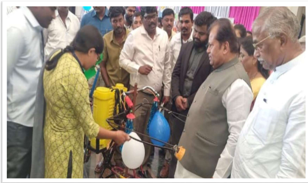
Exhibition organized by the Pourakarmikas at Bagalkot.