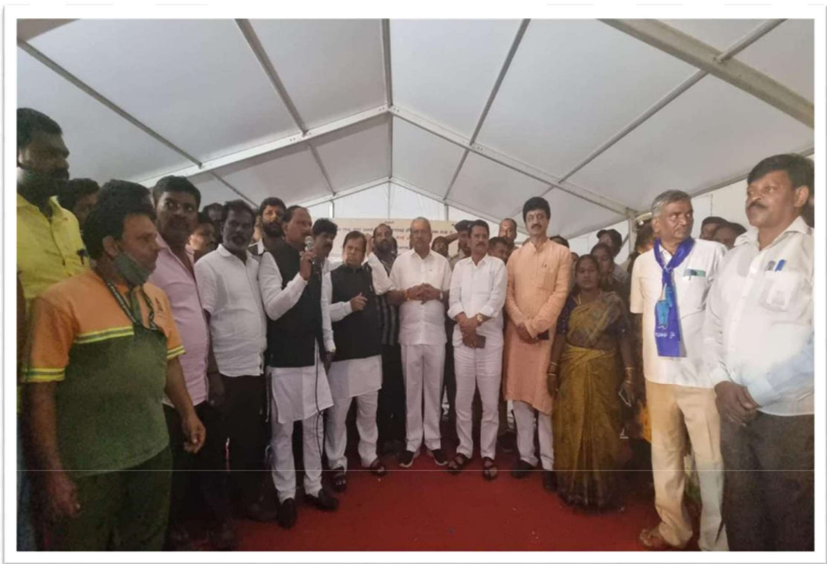
The moment when Pourakarmikas engaged in recruitment related protest at Freedom Park in Bengaluru were directed to call back the protest against the backdrop of the regularisation of services of Pourakarmikas as per the direction of Hon'ble Chief Minister