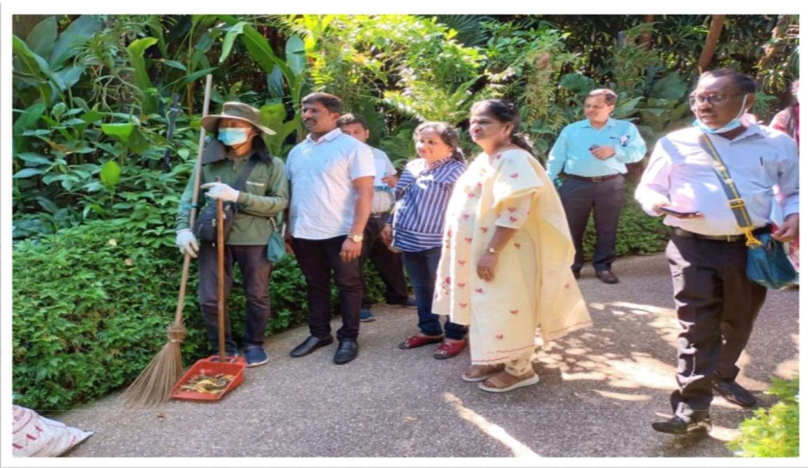
A moment of interaction with the workers cleaning the most famous park in Singapore