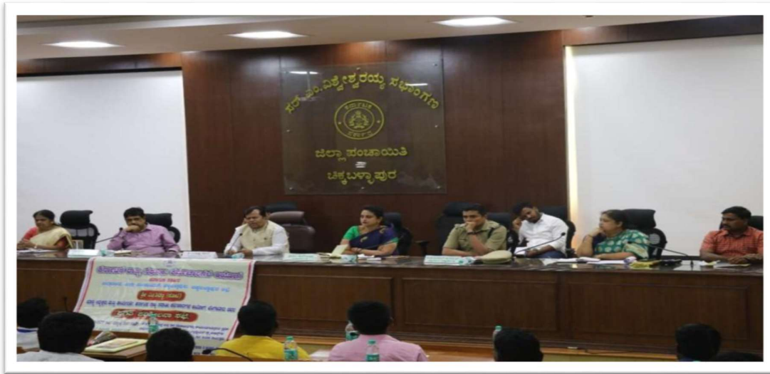
Progress review meeting held at the District Collector's office, Chikkaballapur