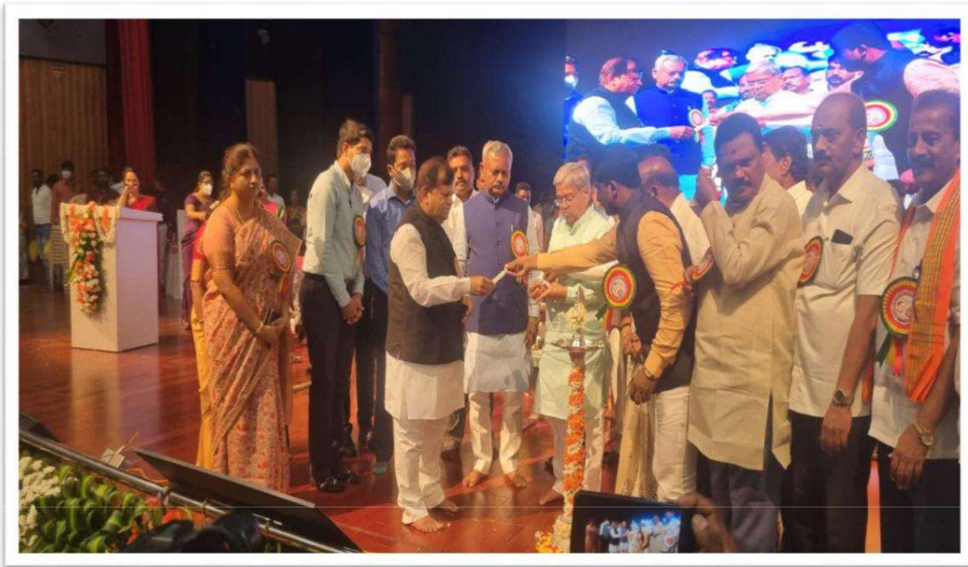
Talent award program held in Mysore district

Talented children of Safai Karmacharis and recognized manual scavengers of the State were felicitated in Pratibha Puraskar program by the District In-charge Minister along with District Administration, District Panchayat, all officials.