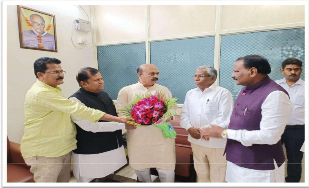
A moment of congratulating the Hon'ble Chief Minister for taking a historic decision in the State and for regularising the services of 11,133 Pourakarmikas.