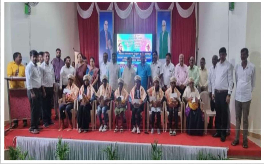
Talent award program for Safai Karmacharis' children held in Hassan district.