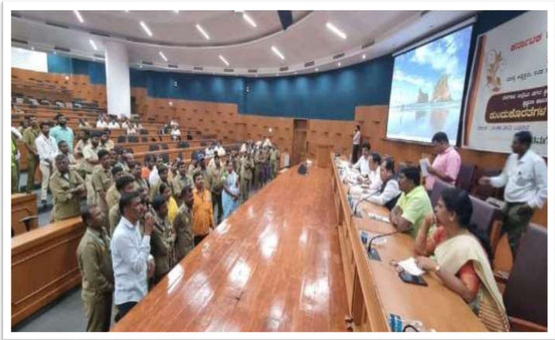
A direct interaction program with the workers including district administration officials about the problems of Safai Karmacharis in Belgaum district.