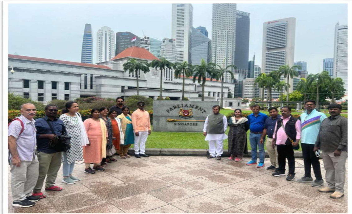
Study team in Parliament House, Singapore

The manual scavenging system was still in practice in Singapore in 1980 but now it has been completely changed to UDG system.