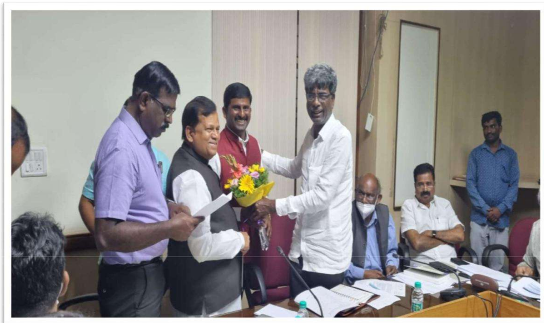
Consultation with the Minister of Social Welfare Department, Chairman of the Corporation and Principal Secretaries of the Department to implement the schemes of the Corporation.