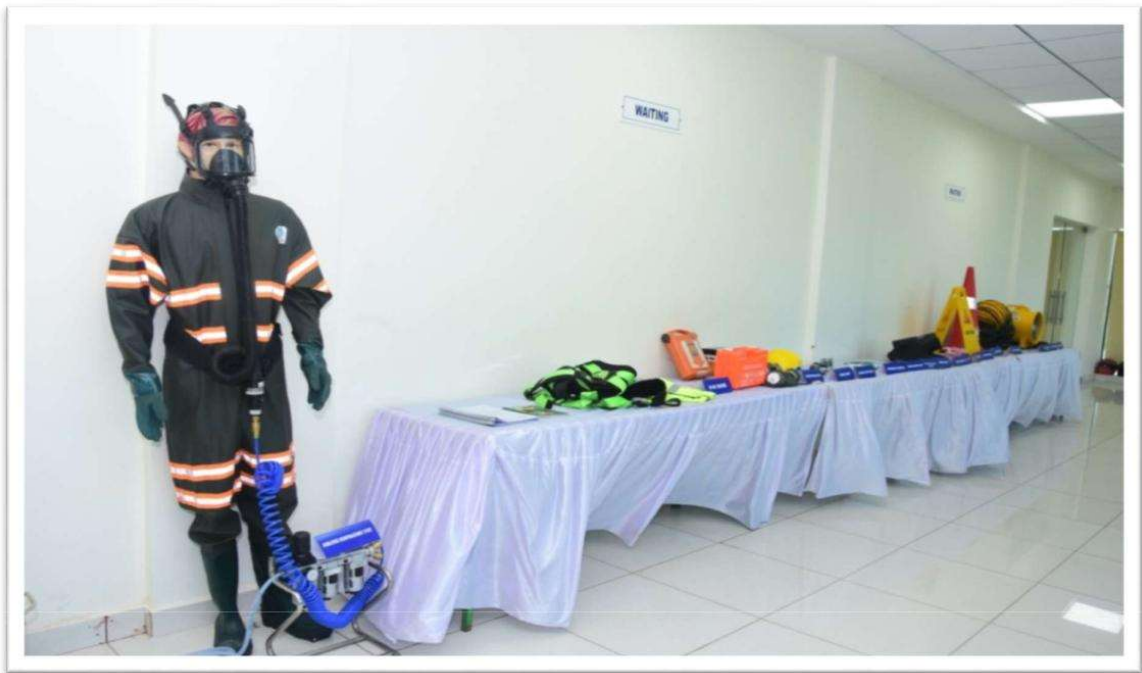
Safety equipment used for manhole cleaning at Odisha Water Academy