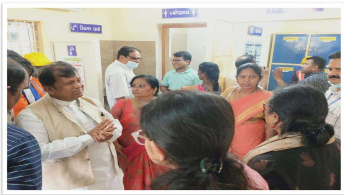
A view of the bathroom and lockers provided in the air-conditioned rest house constructed for sanitary workers in Odisha city.