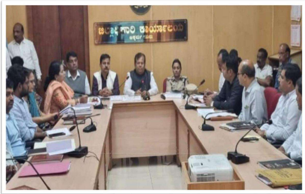
Grievance meeting of Pourakarmikas held in Chikmagalur district