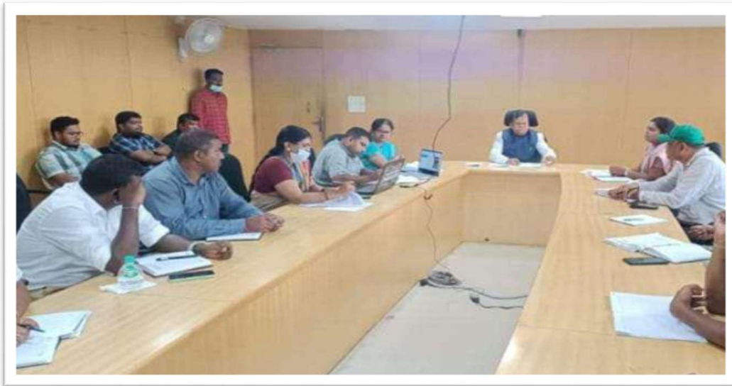
Direct interaction and meeting held with the officials regarding the grievances of the Pourakarmikas and identified manual scavengers working in Bangalore Mahanagara palike, East Zone.